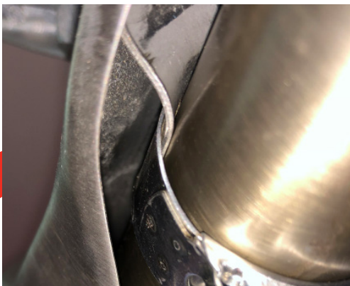
Picture shows the 43-47mm Clamp securing the heat shield when fitting the original silencer.

NOTE: ENSURE SCORPION SYSTEM IS CLEAR OF MOVING PARTS AND ALL ORIGINAL FUNCTIONS WORK CORRECTLY.