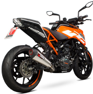
Fitted with the original silencer.

Fitted with a Scorpion Serket Taper slip-on silencer, RKT-87.