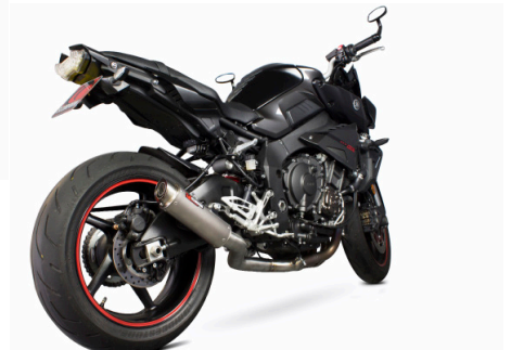
Fitted with Scorpion RP1-GP silencer (YA-1003).