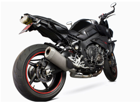
Fitted with original silencer. Retain OE gasket and gasket collar

NOTE: ENSURE SCORPION SYSTEM IS CLEAR OF MOVING PARTS AND ALL ORIGINAL FUNCTIONS WORK CORRECTLY.