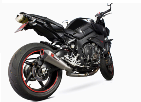
Fitted with Scorpion serket taper silencer (RYA-102).

When removing the O.E catalyst, disconnect the valve cables and remove them from the bike.