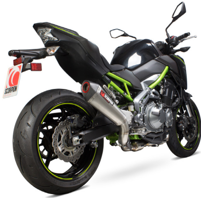
Fitted with Scorpion serket taper slip-on RKA-114